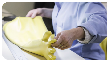
• Length check:

Done by sampling, 1 glove per box. If the sample glove is non-compliant, testing is expanded and every glove is checked.